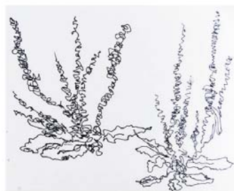
8- Intuitive Drawing of Cat Mint