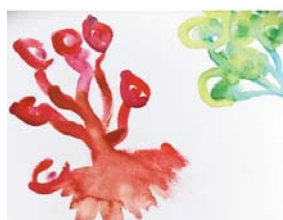
5- Painting with Cat Mint