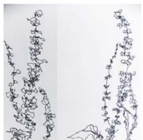
7- Drawing Cat Mint