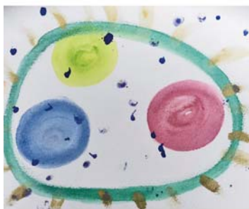
1- Prickly Container