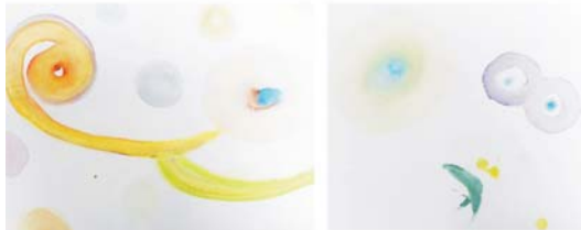
12- Flight and Light Balls