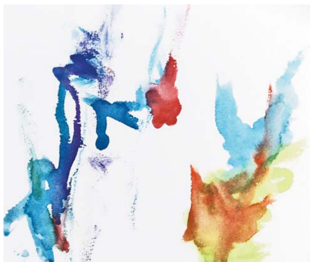
9- Cat Mint Painting eyes opened