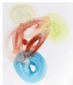
3- Unbounded Heart