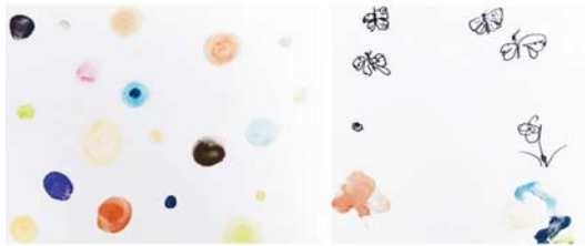
10- Light Balls