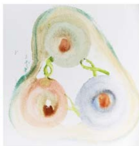
2- Energy Inwards