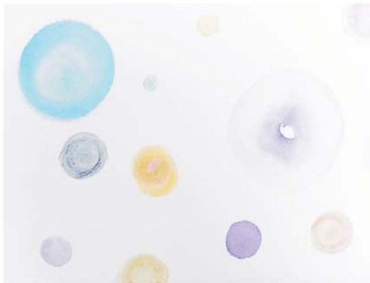
14- Dew Balls