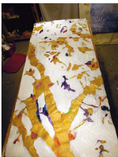
Top: paintings Middle: tree banner Bottom: banner painting

I drew with light and shadow and the following narrative describes an encounter with the shadows of an apple tree in my front yard.